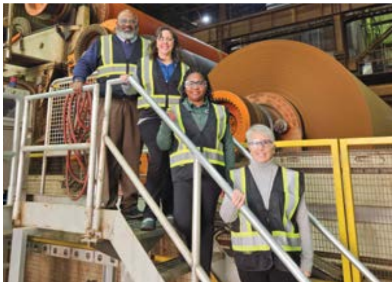
Local Directors of the South Carolina Office of Career and Technical Education recently held a meeting at the New-Indy Catawba facility.

New-Indy Catawba hosted a meeting for local directors of the South Carolina Careers and Technical Education (CTE) program, which included a guided tour of the facility. The CTE program's mission is to cultivate a skilled workforce that meets the needs of business and industry, fostering sustainable growth and economic prosperity for the state. CTE directors from Chester, Rock Hill, and York Tech were among those in attendance. This collaboration highlights another example of New-Indy's commitment to education and the community, working in partnership with state and local entities to help build career pathways for students in grades 6-12.