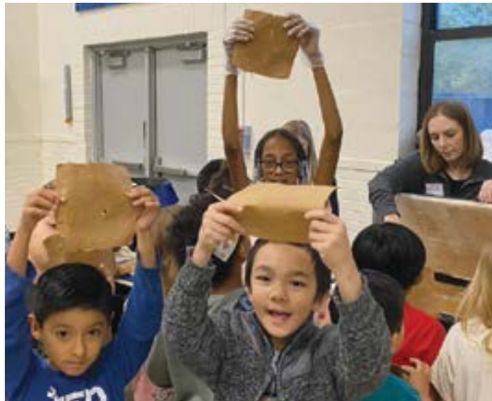
Left: New-Indy Catawba representatives visited Ebinport Elementary School for a paper-making demonstration. Right: Students took home personally-made sheets of paper.