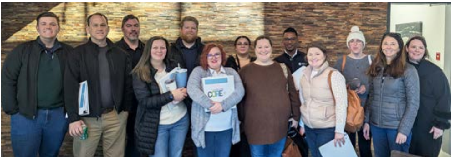
Members of the York County Chamber of Commerce Leadership CORE program visited New-Indy Catawba in January.