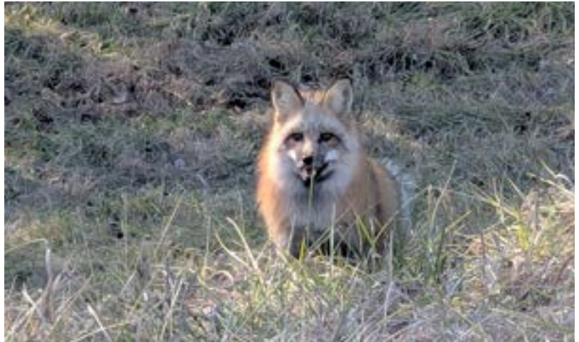
Fred the fox was rehabilitated by Catawba Junction Wildlife Rehabilitation and Farm Animal Sanctuary and released on New-Indy property.

After conditioning him for life in the wild, Fred was released on New-Indy's property along the Catawba River. With its proximity to water, abundant natural cover, and ideal conditions for burrowing and foraging, New-Indy's property provides an excellent habitat for foxes like Fred.