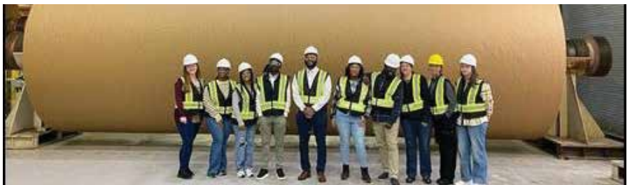
Winthrop University students visited the mill to learn more about how people and systems support organizational operations.

New-Indy recently welcomed juniors and seniors from Winthrop University's College of Business for a mill tour and discussion. The students, who were members of SHRM (Society for Human Resource Management), were eager to learn about the people and systems that support mill operations.