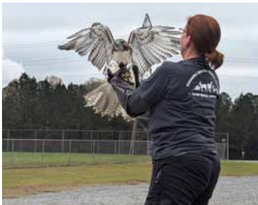
Hulk the hawk was found injured on New-Indy's property and was rehabilitated at nearby Catawba Junction Wildlife.

A red-tailed hawk nicknamed Hulk was found last summer on New-Indy's property with an injured wing. Thanks to months of expert care by the team at nearby Catawba Junction Wildlife, Hulk made a full recovery and recently was released into the wild at New-Indy's softball field.