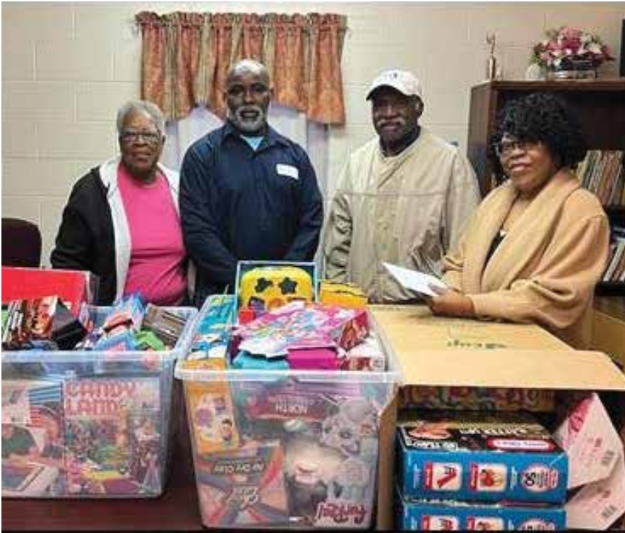
New-Indy employees made food and toy donations in the name of their preferred Palmetto Bowl football team - Clemson or South Carolina.