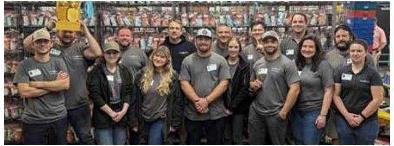
The Foundation for Rock Hill Schools' Back-the-Pack Program helps feed hundreds of children each week.

New-Indy is proud to partner with the Foundation for Rock Hill Schools , a nonprofit organization dedicated to supporting public education in our community. In December, New-Indy funded a teacher-requested grant for the Lesslie Elementary School to build an outdoor classroom. Mill representatives presented the check to the teachers, school administrators, and students who will benefit from the new space.