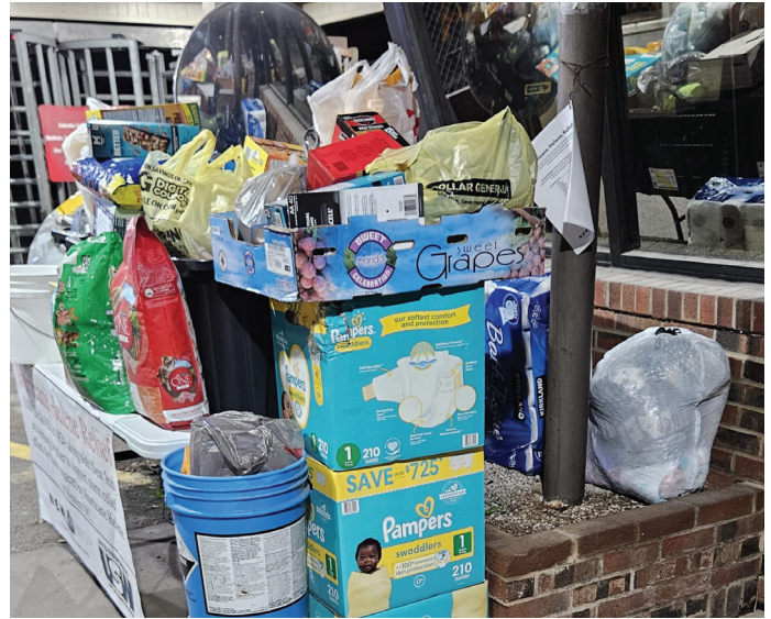
New-Indy employees supported Hurricane Helene relief efforts with money and supplies.

Employees were encouraged to donate supplies or money. The mill matched all financial contributions made to the Red Cross. Water, trash bags, and other necessary supplies were collected and distributed through Harmony Baptist Church in Edgemoore, S.C., to help those affected by the disaster.