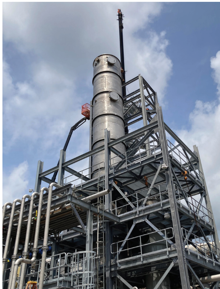
The BAQ authorized the construction of a new foul condensate steam stripper that will increase the disposal of contaminants generated during the paper-making process.