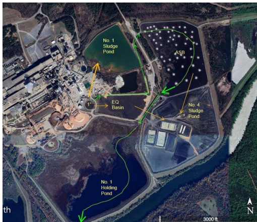
The New-Indy Catawba IBRPP will re-route solid waste from the wastewater treatment system to an on-site sludge pond.

New-Indy Catawba received approval for its Innovative Byproduct Reuse Pilot Program (IBRPP) that will reduce stress on the mill’s wastewater treatment system and produce extensive environmental benefits. Currently, solid waste byproduct from the papermaking process flows through a clarifier and into a basin where it thickens and is removed for disposal. Under the new program, solid waste will be sent to a sludge pond where it will settle.