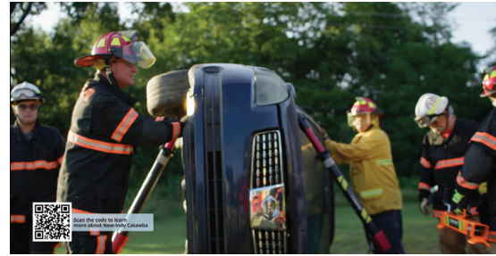
New-Indy supports local municipal organizations like the Lesslie Volunteer Fire Department.