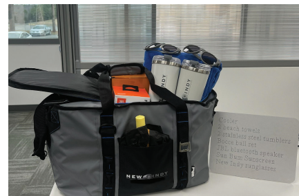
New-Indy Catawba made a beach-themed donation to York Electric Cooperative's charity auction to benefit The Burrell Foundation.

Scan the QR code to visit New-Indy Catawba's YouTube channel and learn more about how the mill helps local non-profit organizations.