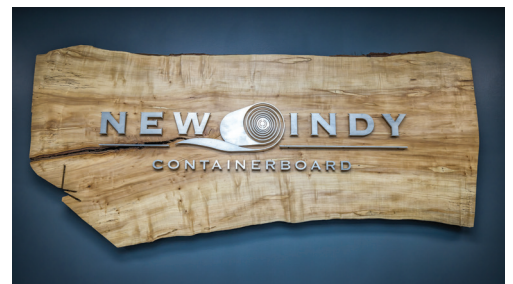
New-Indy Catawba: The mill supports the livelihoods of more than 400 men and women and their families.